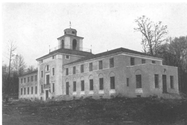
Administration Building ( Psychiatric Quarterly , 1931)