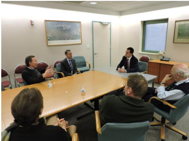
Senator Carlucci met with NKI administrators and investigators

On December 9 th , State Senator David Carlucci visited NKI to meet with administrators and Center for Dementia Research scientists, and to view two state-of-the-art microscopes (Zeiss LSM 880 Confocal Laser Scanning Microscope and Leica LMD7000 – Laser Capture Microdissection System). These new microscopes were acquired through Senator Carlucci’s advocacy and support. They enable unprecedented exploration of the brain at the level of single neurons as they develop Alzheimer’s disease, and will help ensure NKI’s continued scientific leadership toward the goal of a world without Alzheimer’s disease. Senator Carlucci tweeted about the visit on December 11 th .