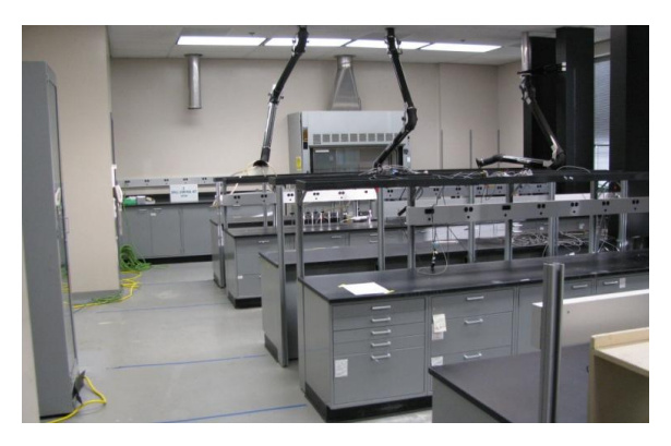
A lab is prepared for the contractors by removing all equipment ...