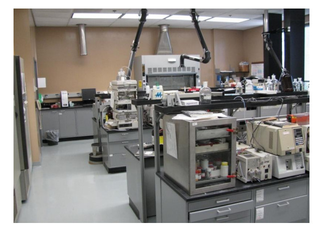
The refurbished lab - like new!