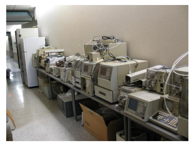
... which is placed in the hallway for the next week.