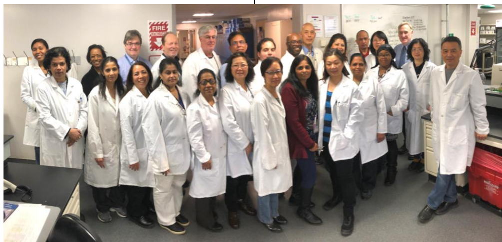
Staff of the OMH Clinical Laboratories at NKI

The week of April 21-27 is National Medical Laboratory Week . It's a great time to thank the health professionals who work in the laboratory – Clinical Laboratory Scientists, also known as Medical Technologists. Clinical laboratory professionals are responsible for performing laboratory tests that provide over 70% of the information for medical decision making. Laboratorians work tirelessly for patient health and do so with little recognition, but the impact of their work is significant.